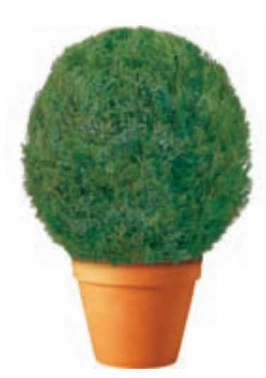
Globes available in 7" - 60"