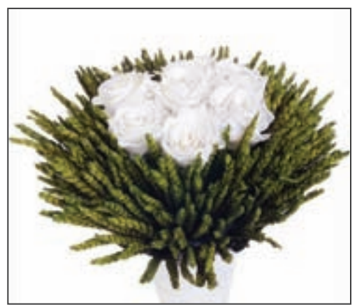
Wheat Grass & Rose in Vase