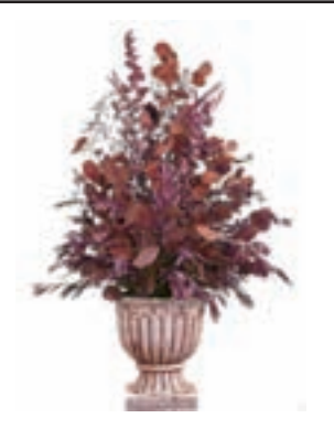
Eucalyptus Oasis available in 28" (shown in mixed cabernet)