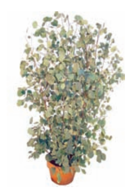
Eucalyptus Tree sizes available are 4', 5.5', 7.5' & 9.0' (shown as 4' silver dollar in sage)