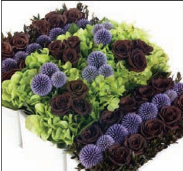
Roses, Hydrangea & Mini Myrtle