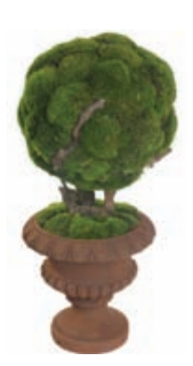
Natural Moss Ball 40'' tall urn included