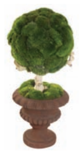
Sand Blasted Moss Ball 40'' tall urn included