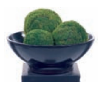
Moss Ball Set available in 5", 6" & 7" larger sizes available