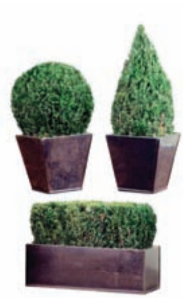
Tabletop Juniper Set Globe in 6" Bronze Cube Cone in 6" Bronze Cube Hedge in 12" Bronze Box