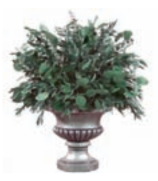
Eucalyptus Table Top available in 24" (shown in mixed green)