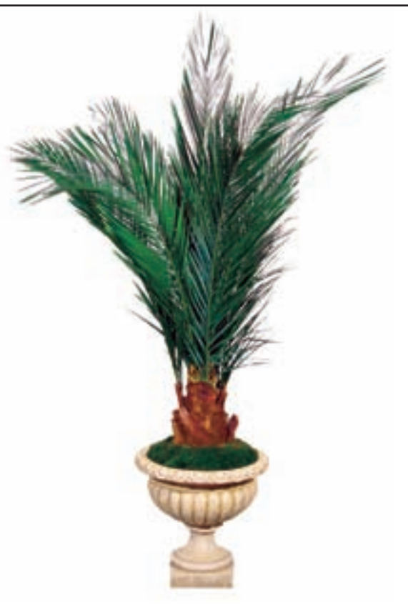
Key Largo Palm sizes range from 40"- 120" (8-10 palm fronds) shown in Antique White Villa Urn