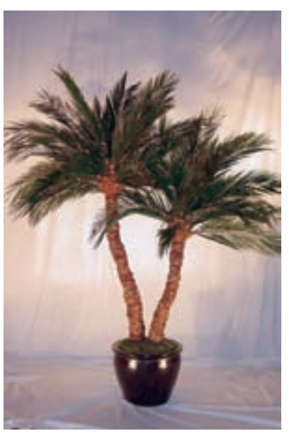
Aloe Palm sizes range from 84"- 120" larger sizes are available