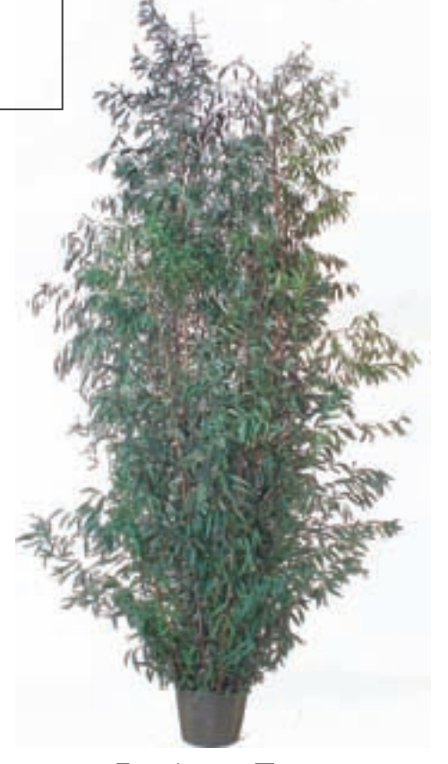
Eucalyptus Tree sizes available are 4', 5.5', 7.5' & 9.0' (shown as 7.5' willow in green)