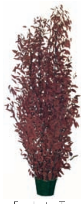
Eucalyptus Tree sizes available are 4', 5.5', 7.5' & 9.0' (shown as 5.5' willow in cabernet)