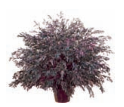
Eucalyptus Bush available in 34" (shown in plum)