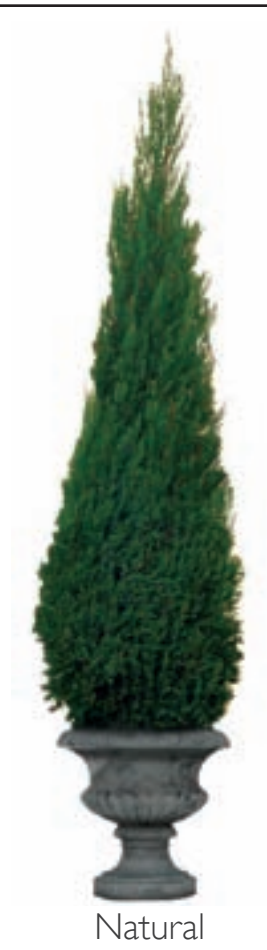
sizes range from 20"- 120" (shown in lead Roman Urn)