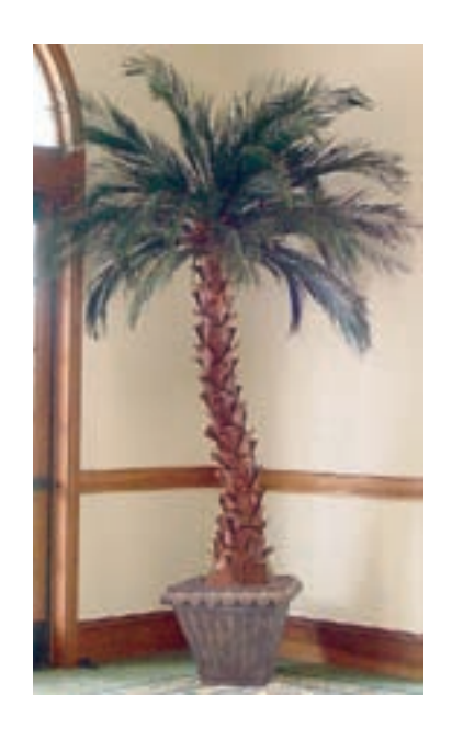
Date Palm sizes range from 84"- 120" larger sizes are available